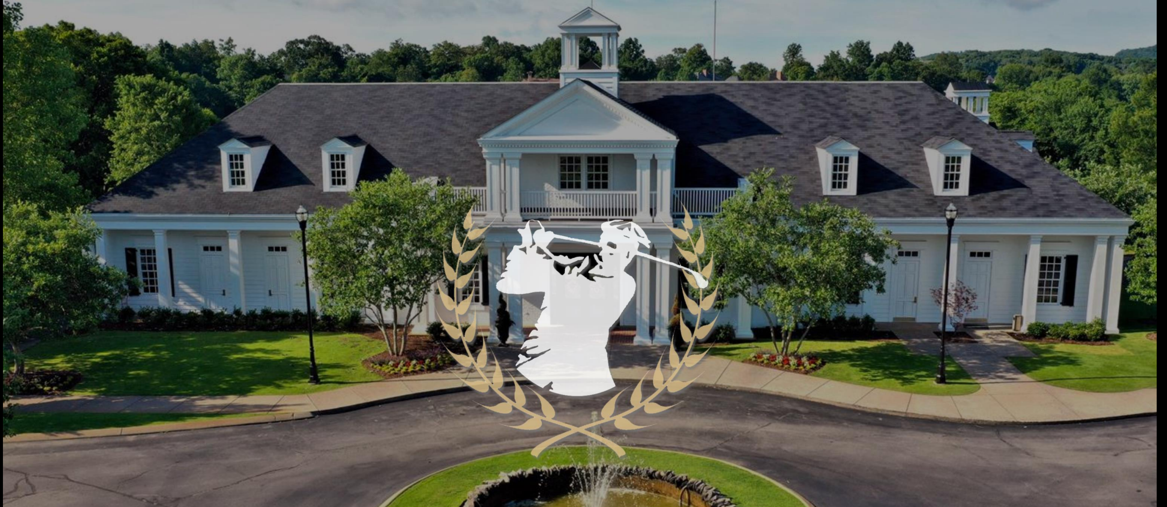
THE GOVERNORS CLUB, BRENTWOOD, TN